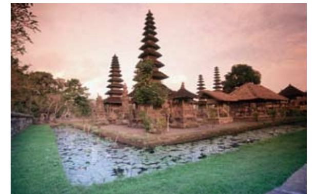
Taman Ayun Temple