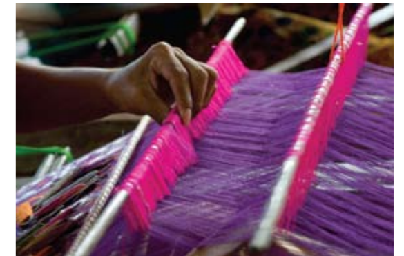
Weaving Ikat Cloth